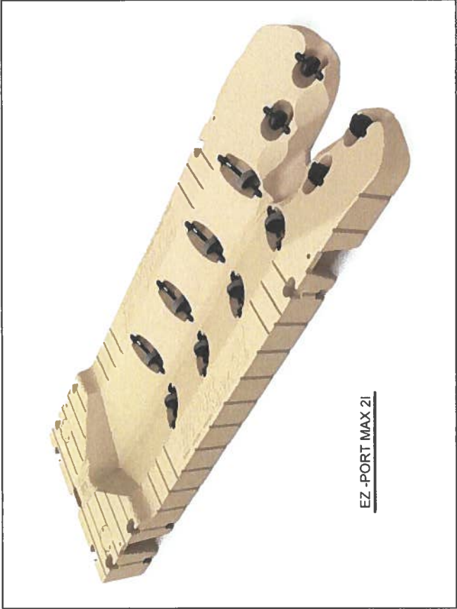
EZ-PORT MAX 21