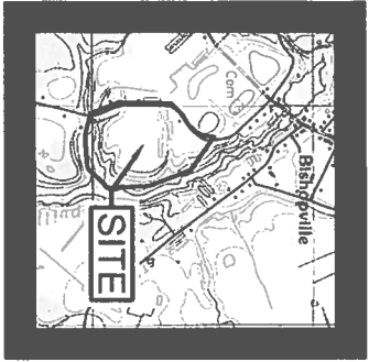
VICINITY MAP SCALE 1" = 2,000'