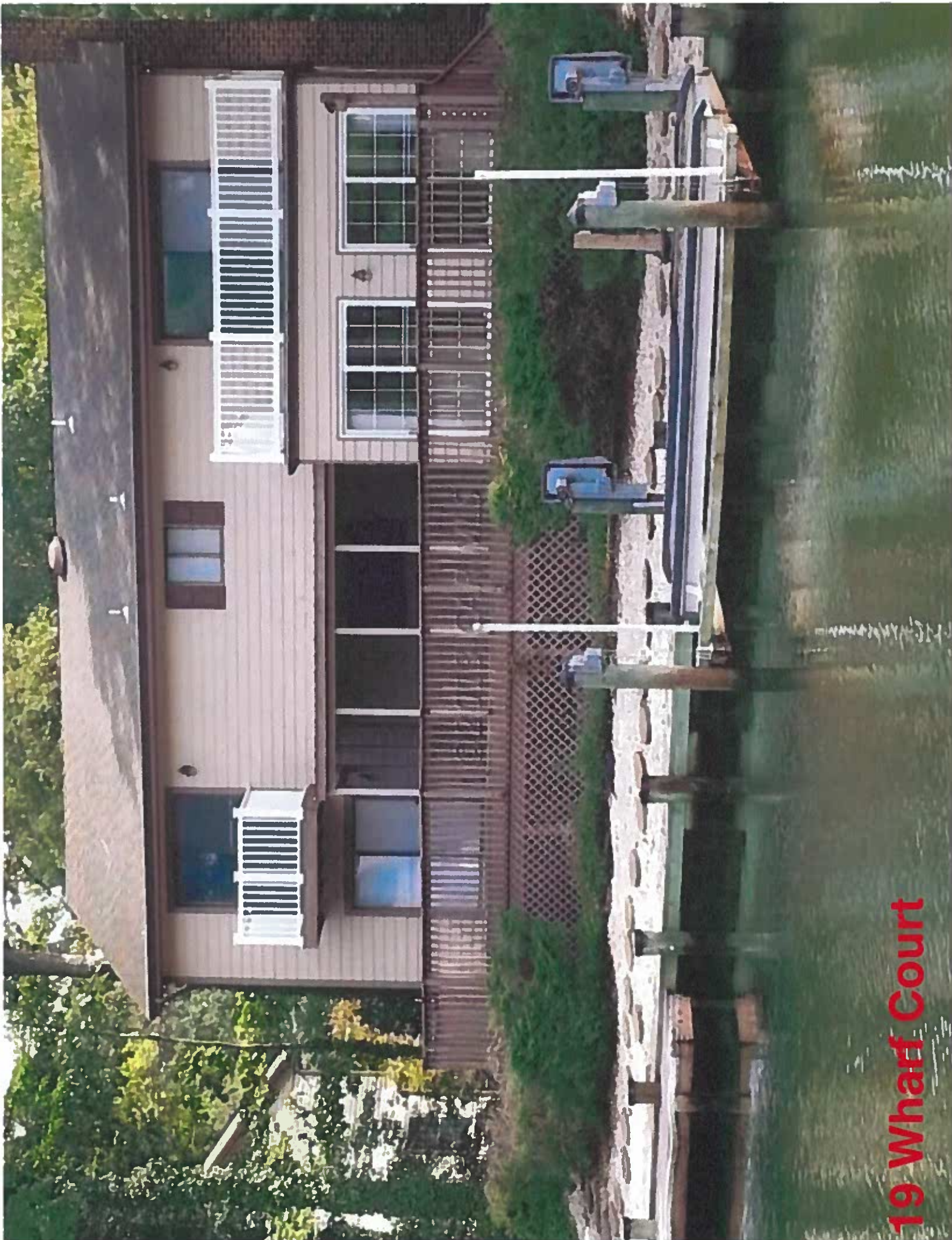
19 Wharf Court